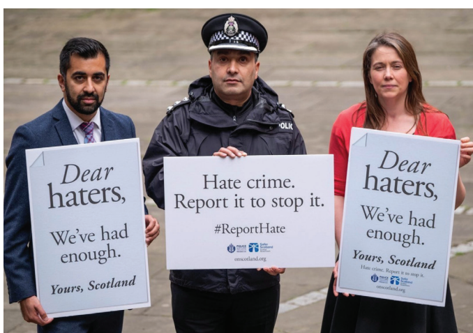
In early 2021 the Scottish Parliament passed controversial laws which criminalise offensive speech, even if spoken in private around the family dinner table.

The hidden agenda behind such laws is the development of a culture of fear and self-censorship for the purpose of political intimidation and control. Thoughts and ideas which are undesirable to special-interest groups will be able to be silenced simply by framing them as "hateful". Such groups will claim to believe in free speech, just as long as it's speech THEY approve of.